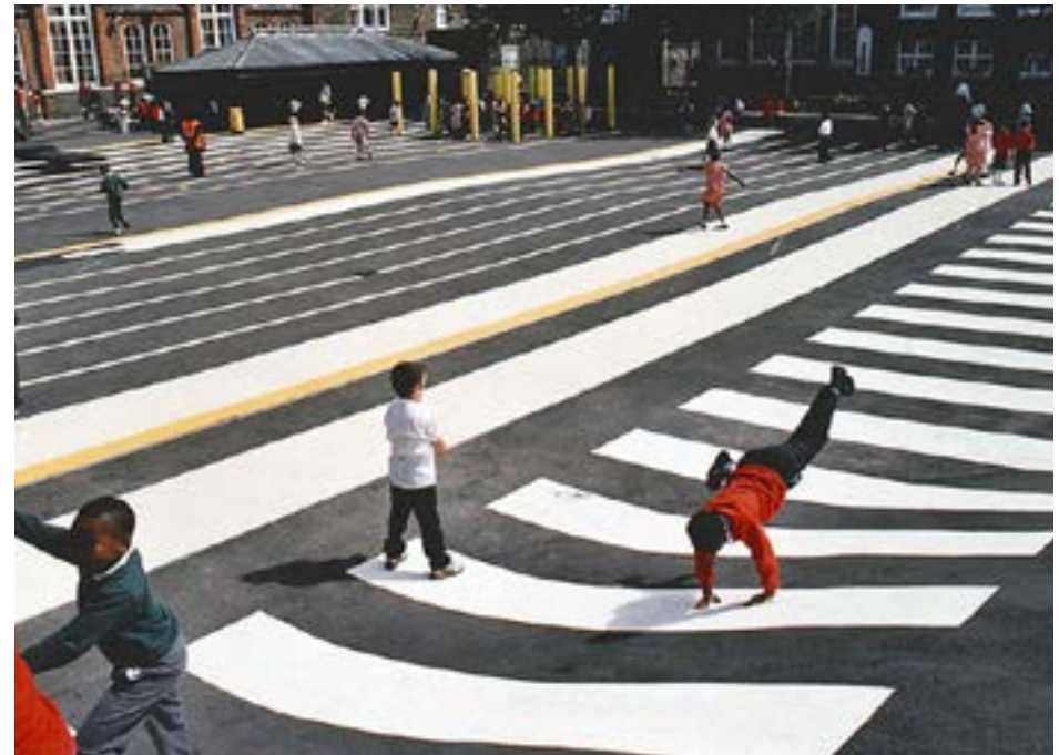
Painted lines, dots, circles and other shapes to inspire free play and game invention