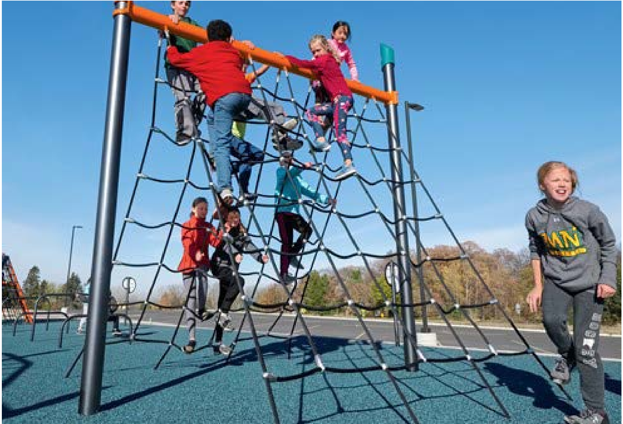
Fitness circuit for physical education and free play