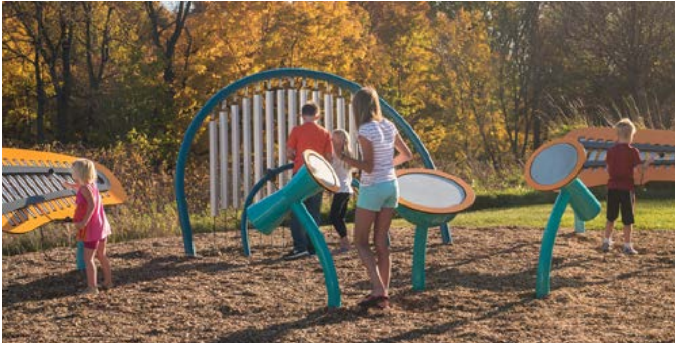
Music rooms for classes and free play