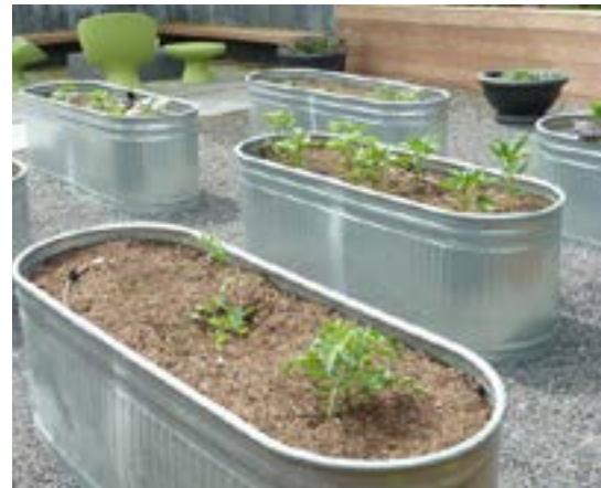
Simple raised planters for school gardens