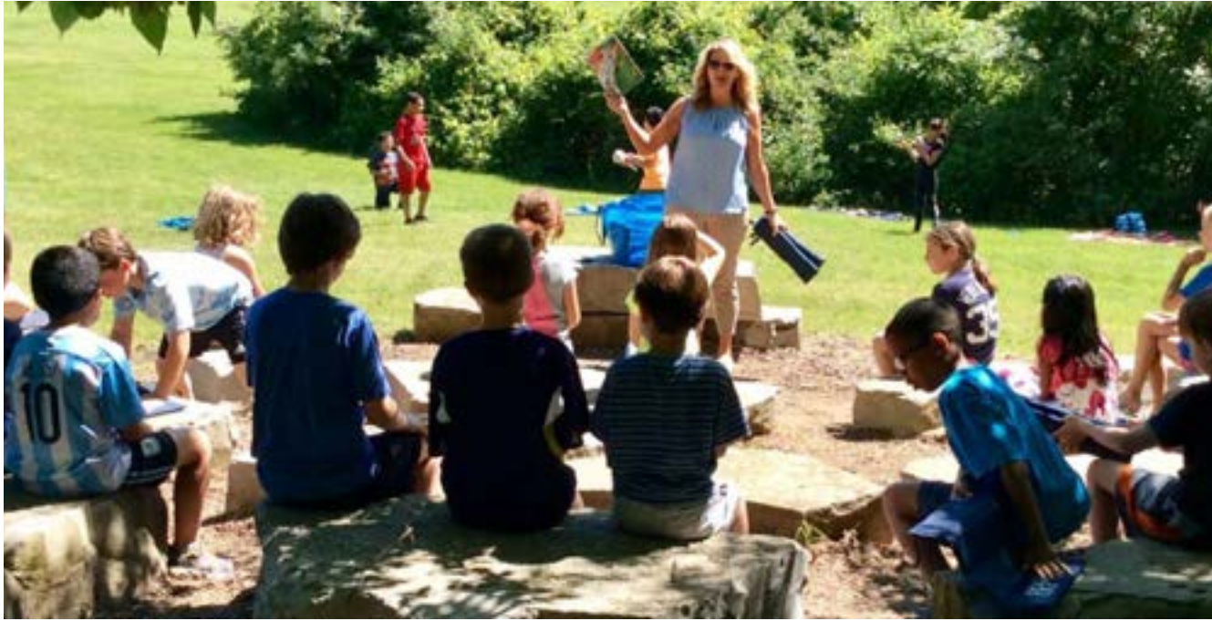
Outdoor rooms with natural seating for classes and social time