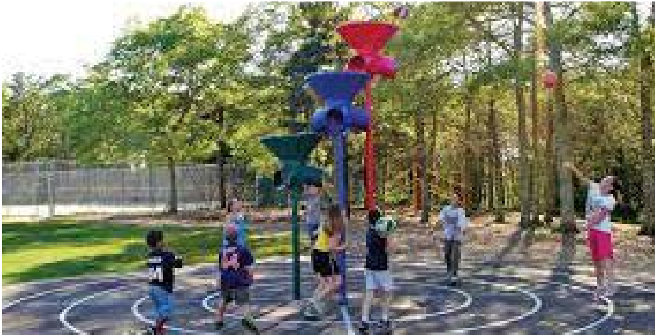
Drop shot hoops for overlapping games and multiple users