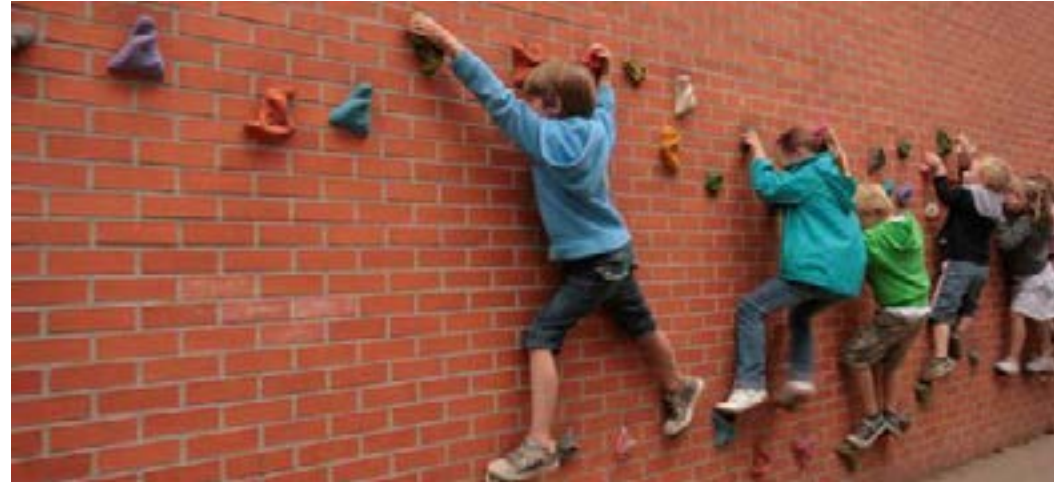
Simple climbing wall