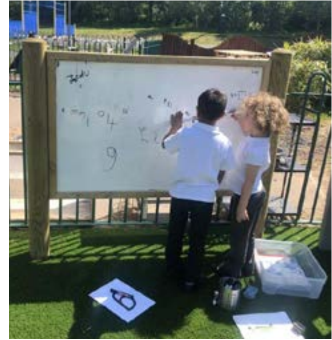
Exterior boards for lessons and play