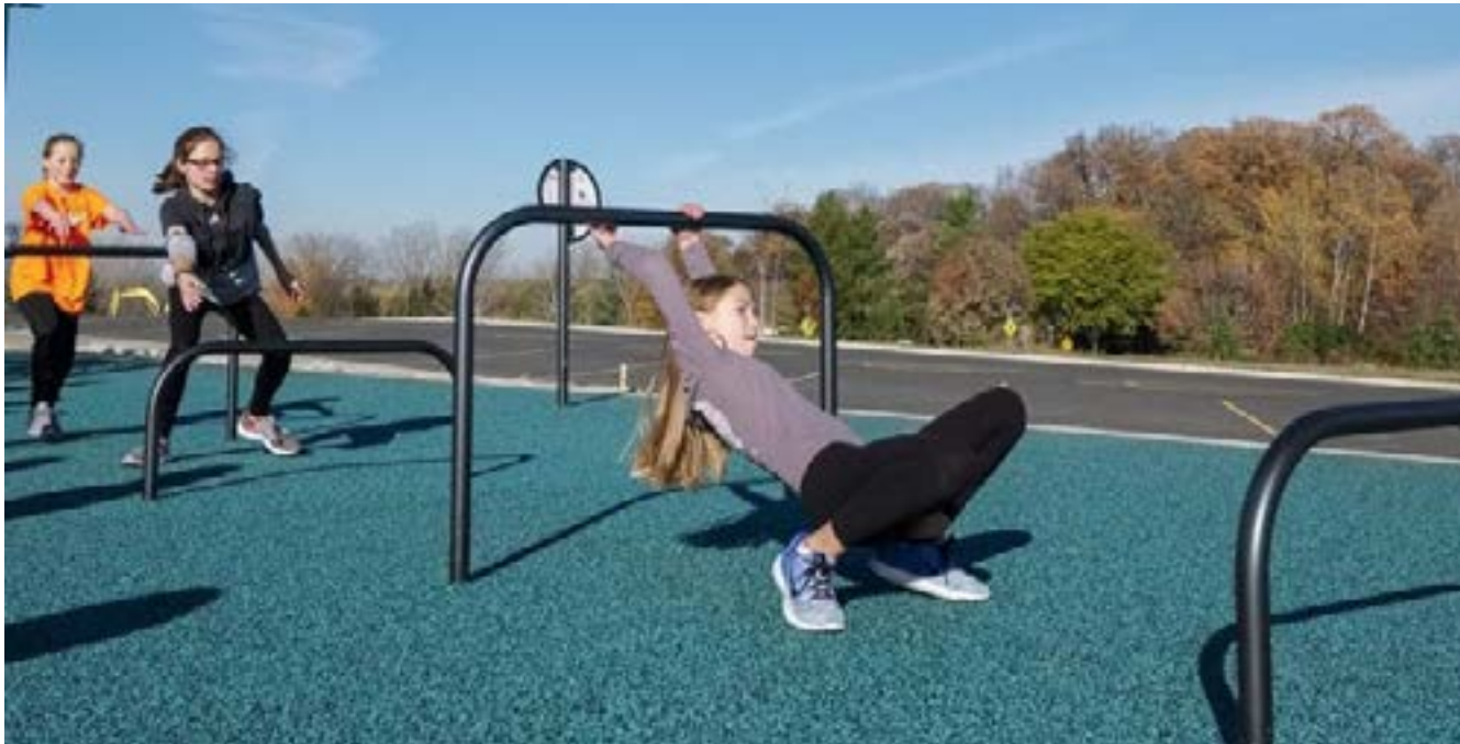
Fitness circuit for physical education and free play