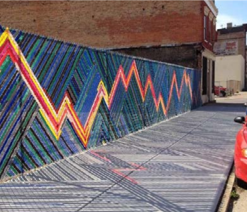
Colourful privacy art and privacy