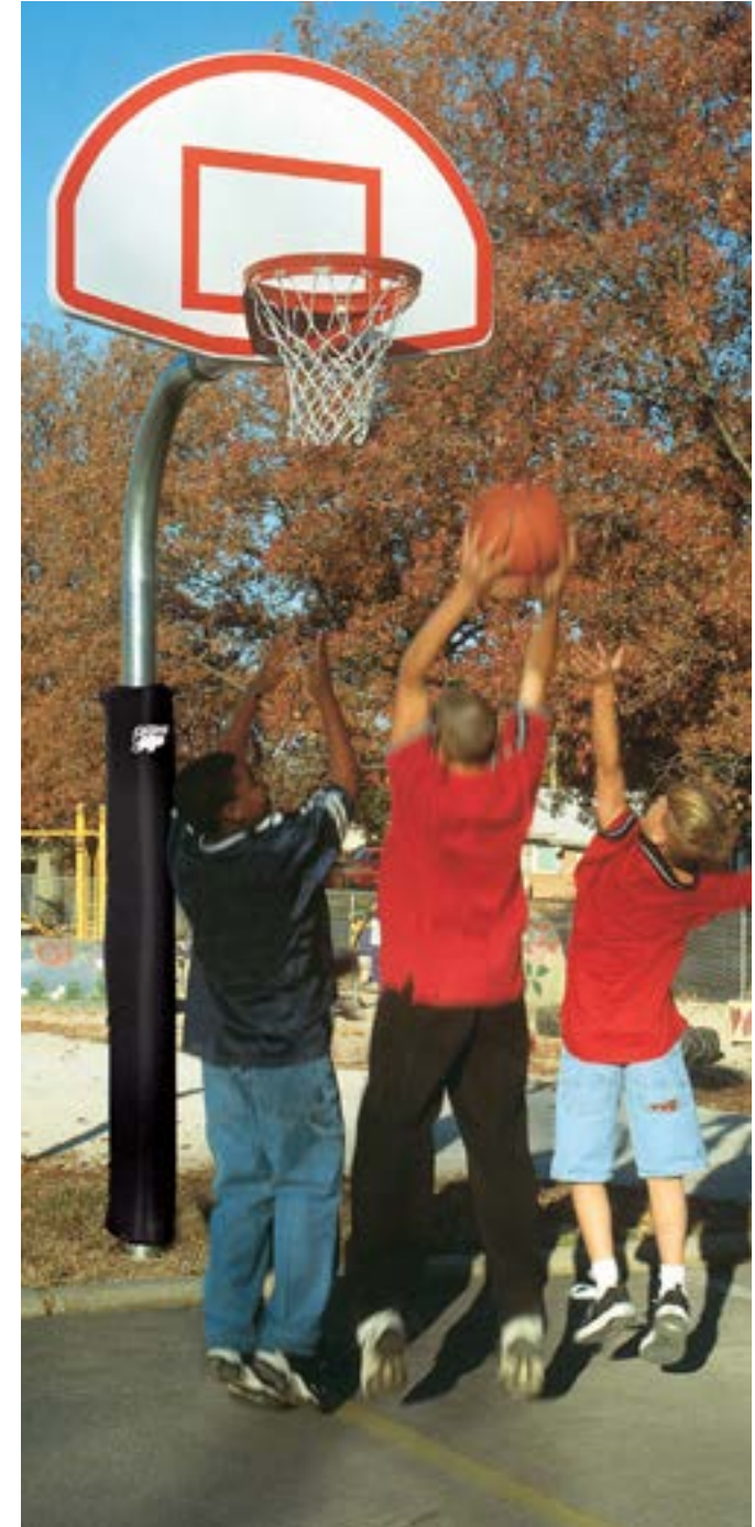
Formal basket ball