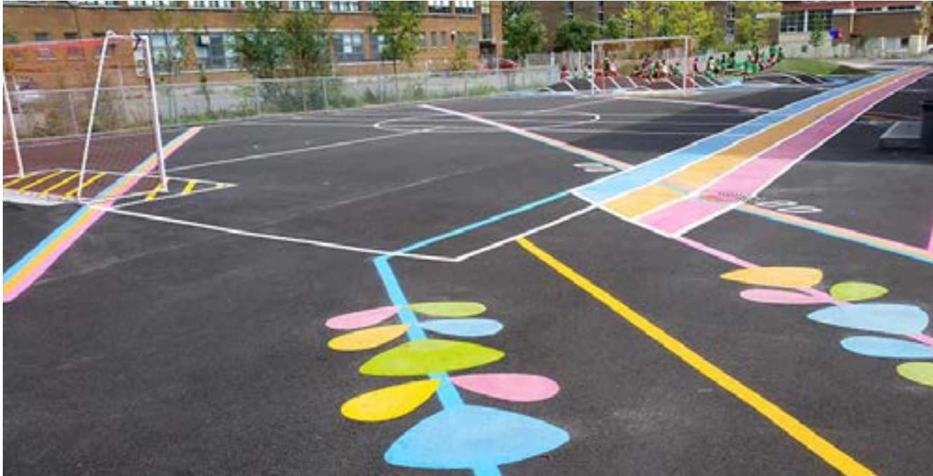
Line painting can overlap to define various courts and games