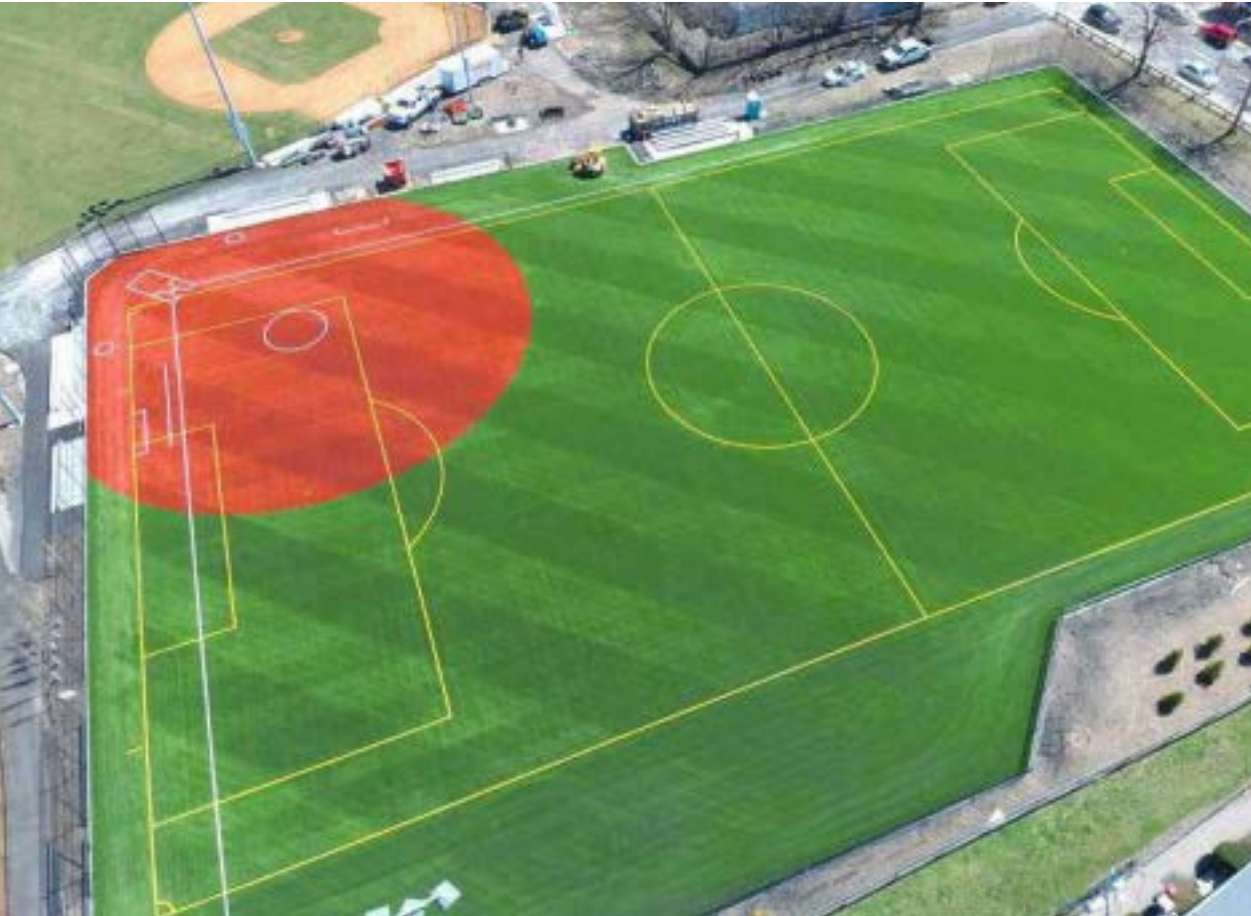
A field for multi games.